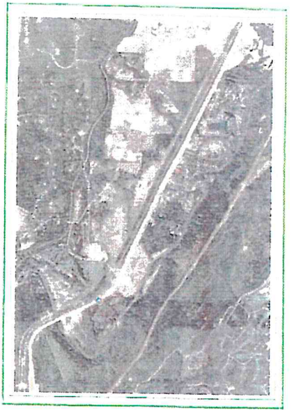
Vicinity Map: N75

Survey References: Volume 3 of State of Maps Numbers 67, 68, 69, 70 and 71, Records of Kittitas County, State of Washington.